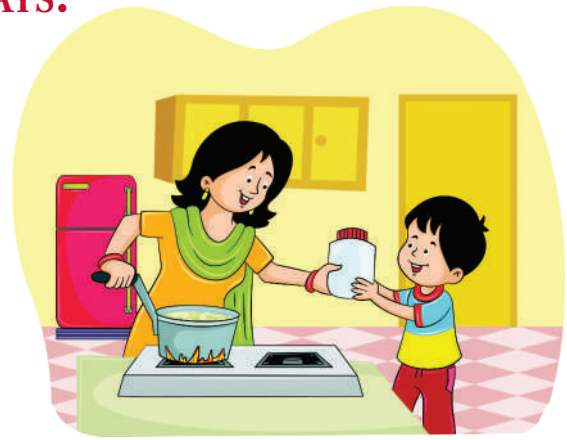
They help the mother in the Kitchen.