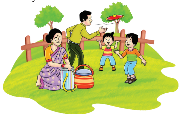
We go to picnics.