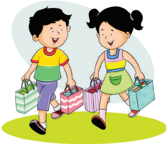
They also help to carry things.