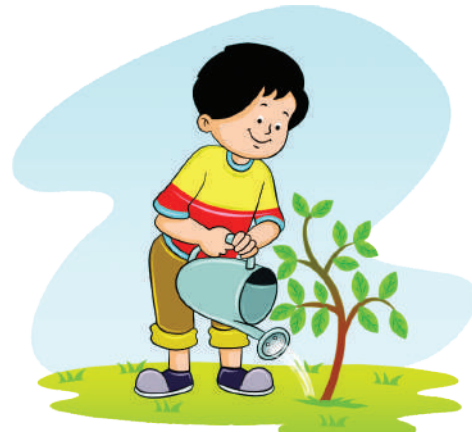
They water the plants.