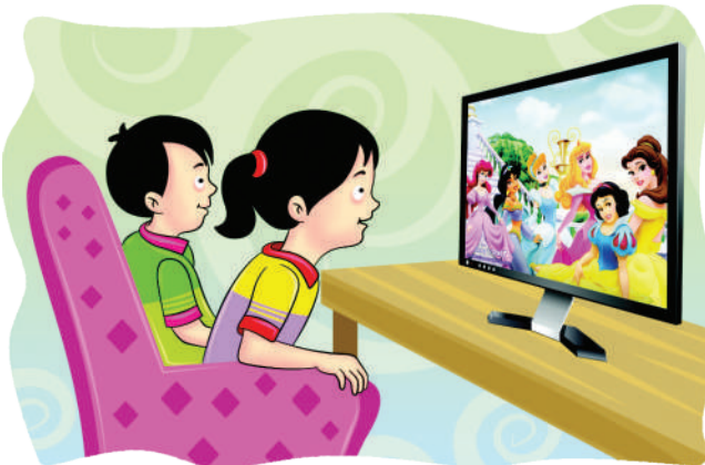
We watch movies.

Every family has fun together in different ways.