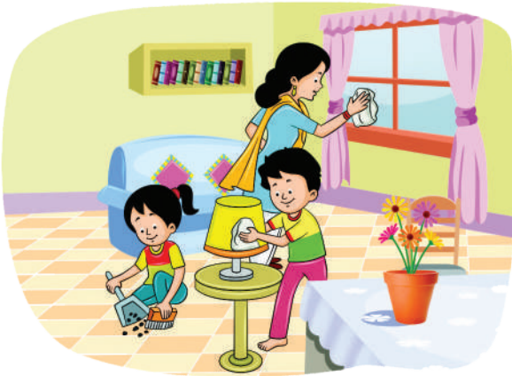
Children help to keep the house clean.