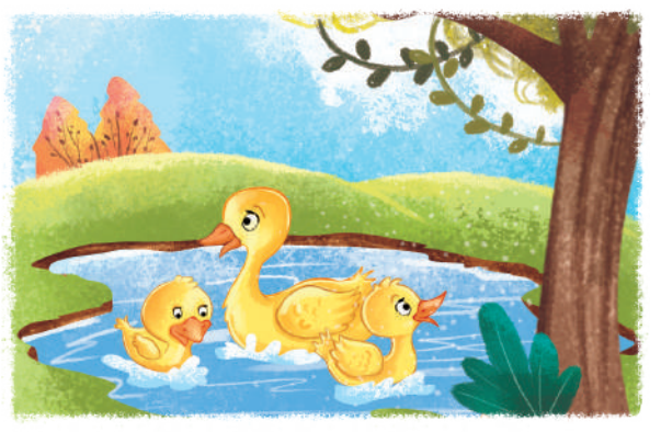
Ducks are swimming in a pond.